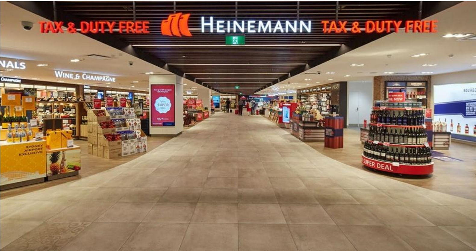
Heinemann Duty Free | Sydney International Airport | Geyer Architects