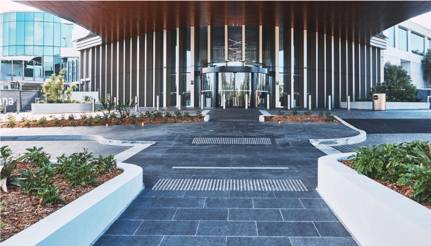
Club Mounties main entrance

Tableau L7 - 155 Clarence St. Sydney 2000 Common area, reception & breakout ceramic tiling