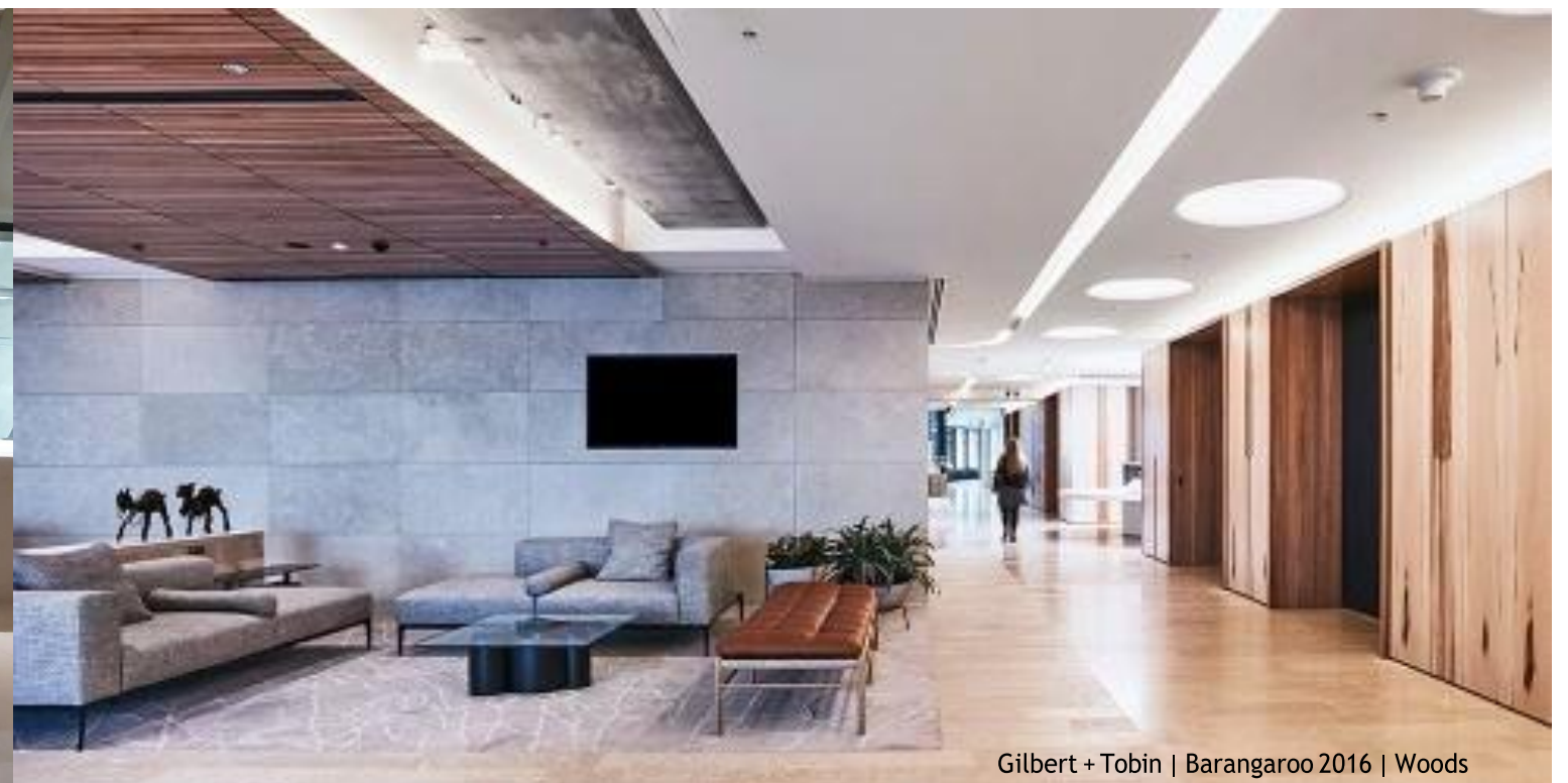
Gilbert + Tobin | Barangaroo 2016 | Woods