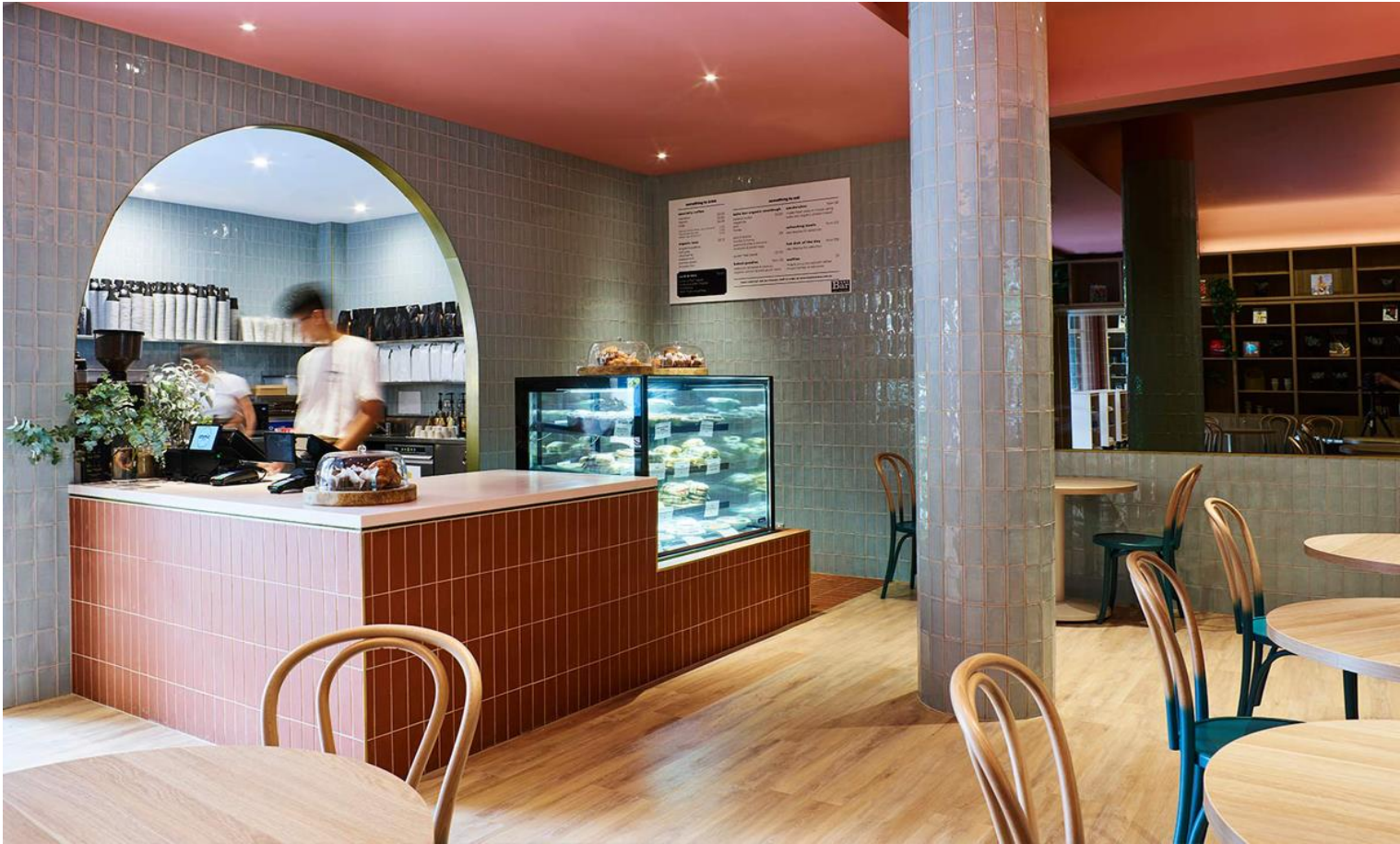
UNSW Bookshop | Kensington 2019| WMK Architects