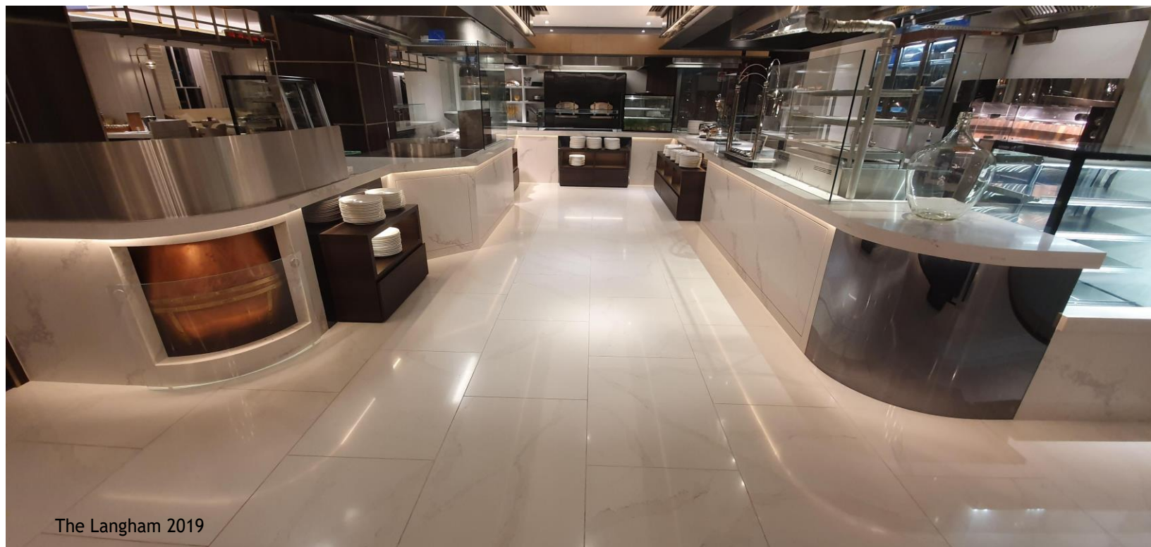
The Langham 2019