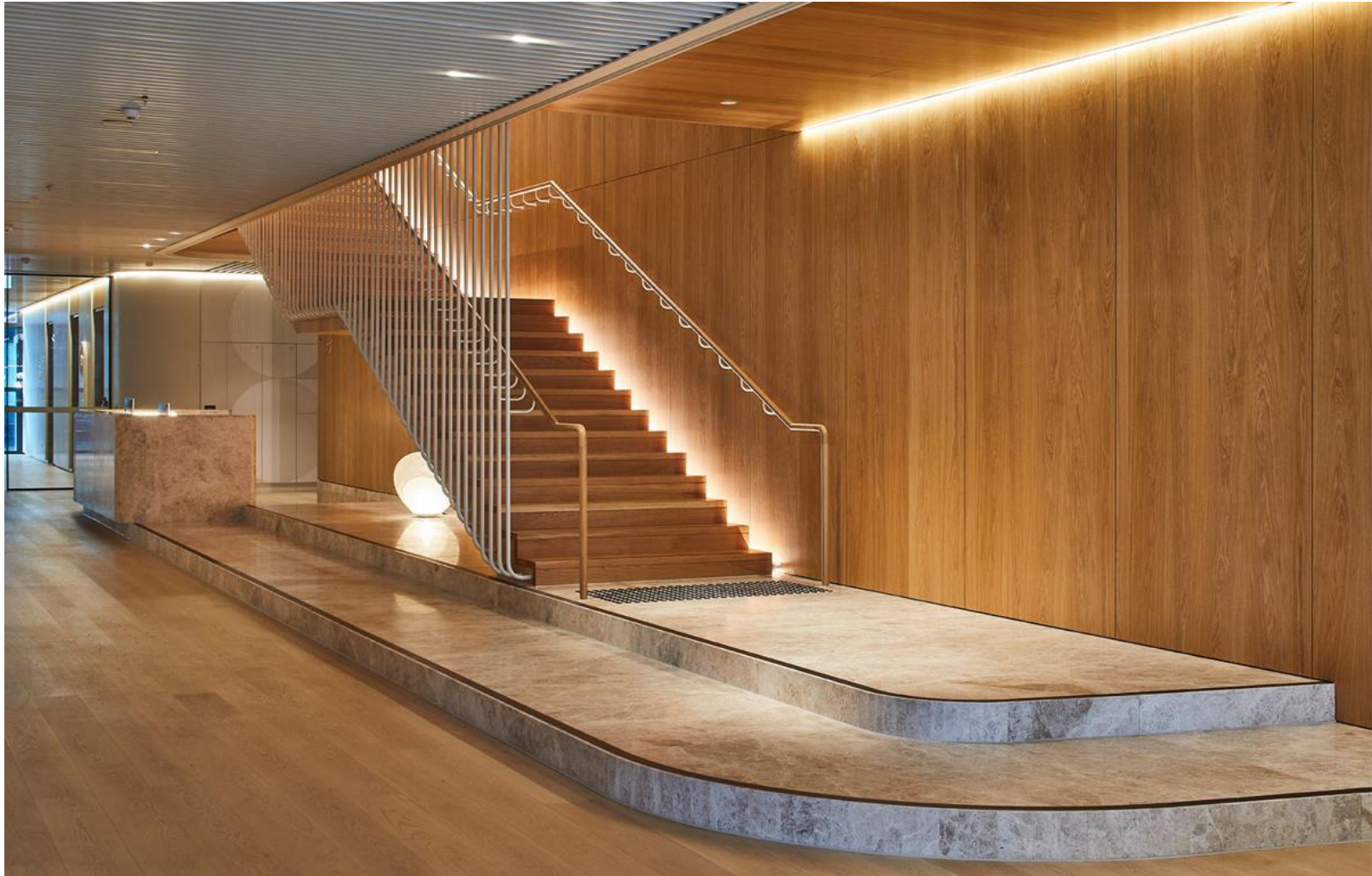
Colonial First State main stairway

The Langham Hotel 89-113 Kent St, Millers Point NSW 2000 “All day dining” & kitchen refurbishment in natural stone