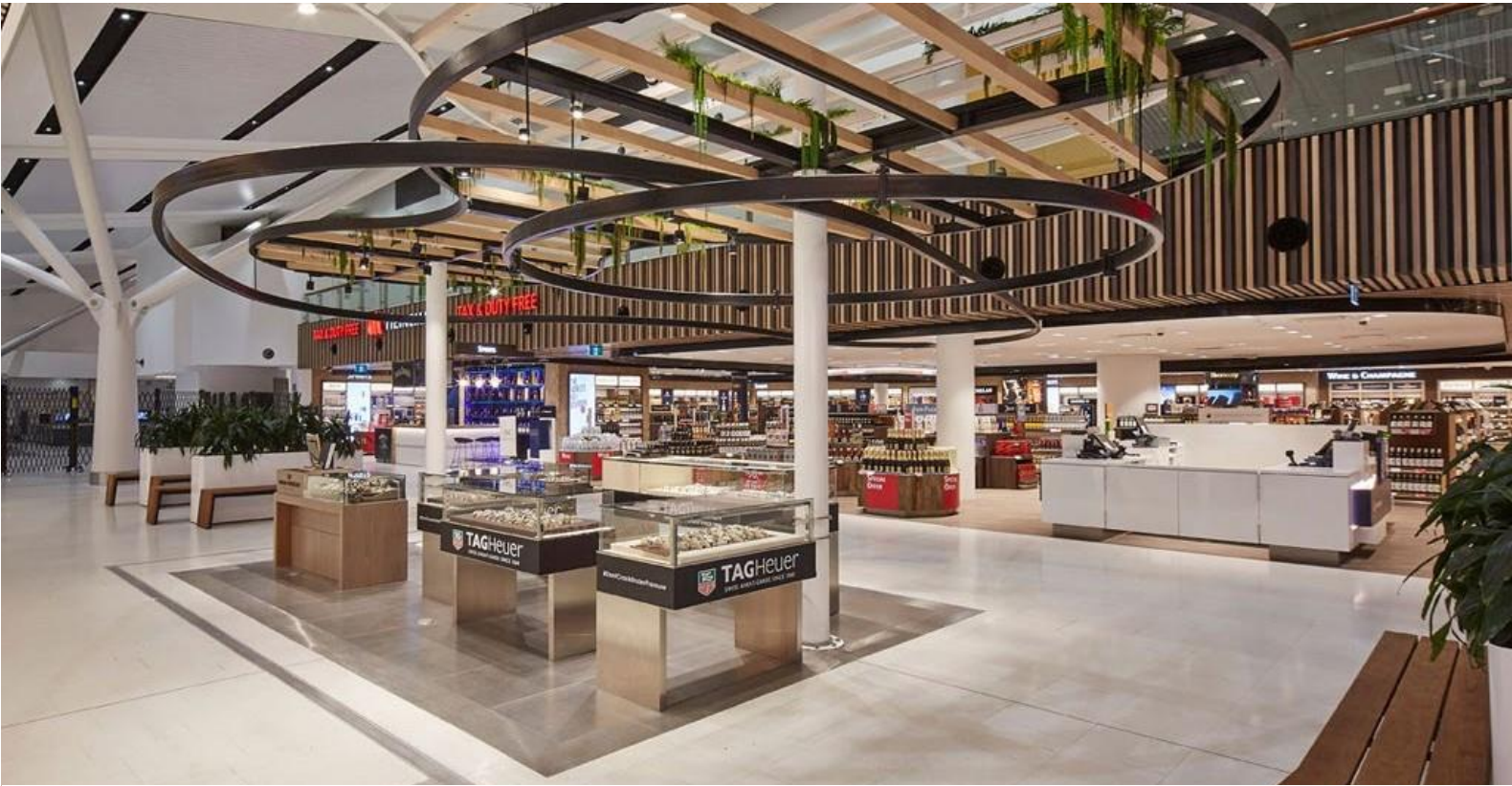
Heinemann Duty Free

UNSW Bookshop Quadrangle building, College Rd, Sydney 2052 Terracotta & ceramic tiling to main bookshop area & cafe