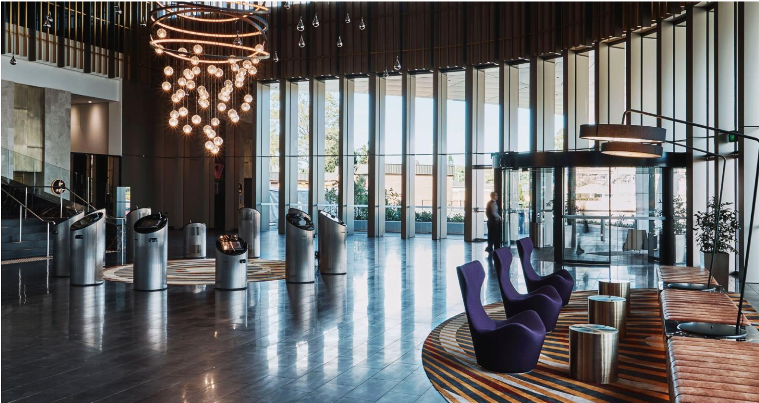
Club Mounties | Mt Pritchard 2016 - 2017 | WMK Architects